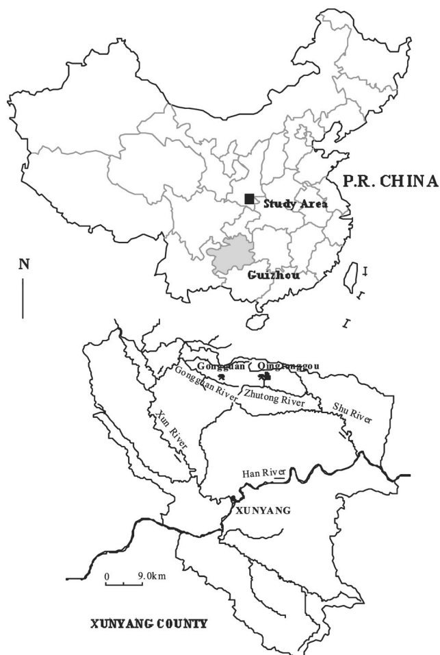
Fig. 1 Map of the study area and the primary regions where rice MeHg studies (Guizhou province, gray) were conducted in China.

Gongguan River. Owing to the drainage and mine-wastes discharges from mining and retorting, the Gongguan and Zhutong Rivers were contaminated with Hg.